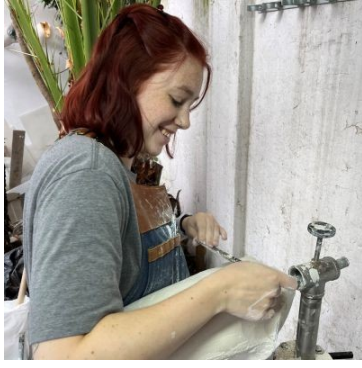
O&P Students Bring Hope, Happiness to Patients in Ecuador