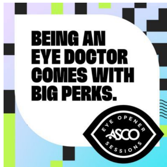
Register to be an OD mentor, refer a prospective OD student and more information.