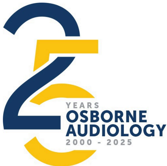
Submit your story for our website and social media as part of the 25th anniversary.