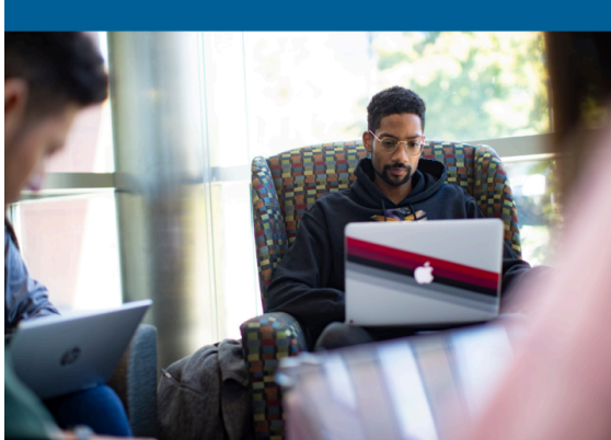
Help shape the future of the University and make a lasting impact.