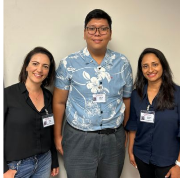
Audiology Workshops Offer a Wealth of Knowledge