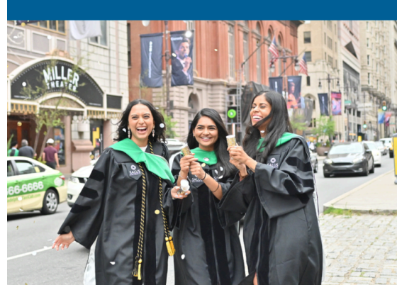
Check out reports about Salus from worldwide media outlets.