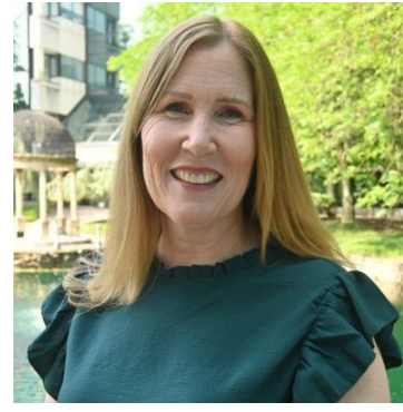
New Orthotics and Prosthetics Faculty Member