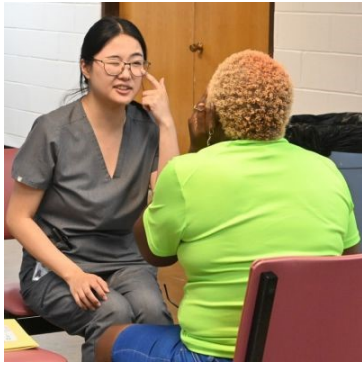
NOA Conference Takes Over Philadelphia