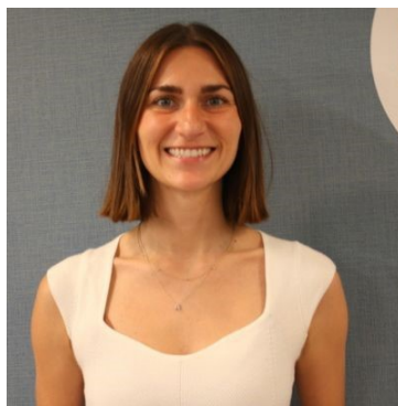
Celebrating the Class of 2024 at Ninth Annual Residents' Day